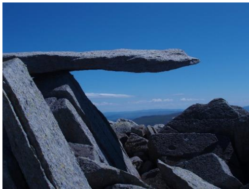
The Cantilever, Glyder Fach