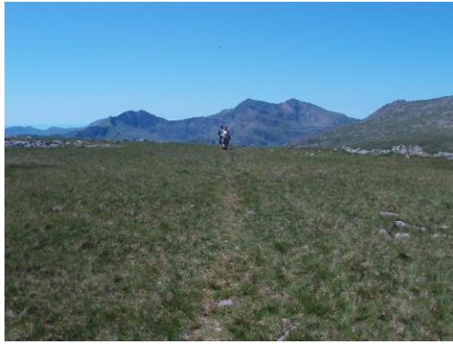
Views south-west to the Snowdon massif