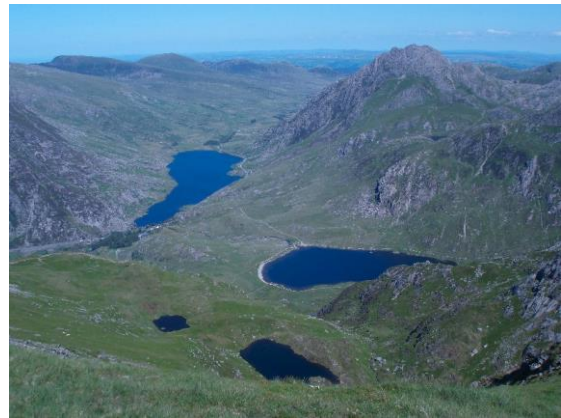
View down to Llyn Idwal and Llyn Ogwen, from Y Garn.