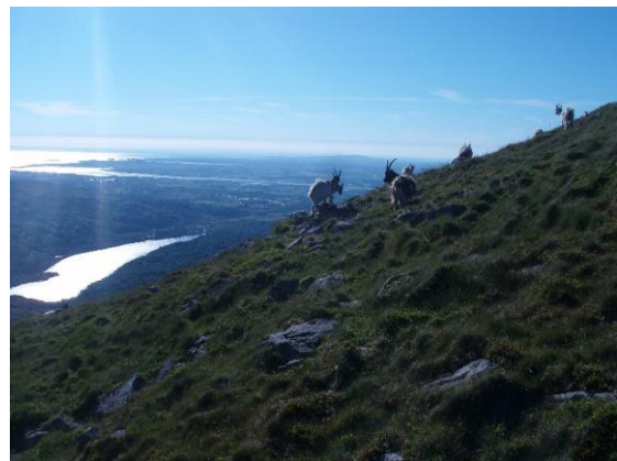
Goats encountered on descent from Elidir Fach