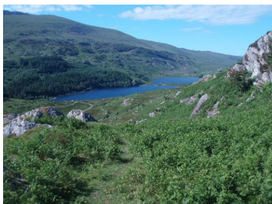
View towards Llynau Mymbyr

On this particular morning, conditions could hardly have looked more promising as the four of us left the car at the rear of Joe Brown's shop at Capel and headed up the rocky ridge end of Cefn y Capel with improving views of the twin lakes of Llynau Mymbyr, then westerly, by the gently ascending grassy slopes of Bwlch Goleuni with fine vistas in the clear morning air, south-west towards the Snowdon massif and the skyline ridge of Crib Goch.