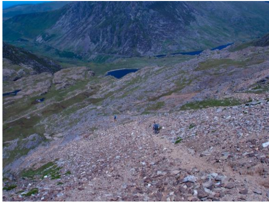
Steep, loose descent from Glyder Fawr