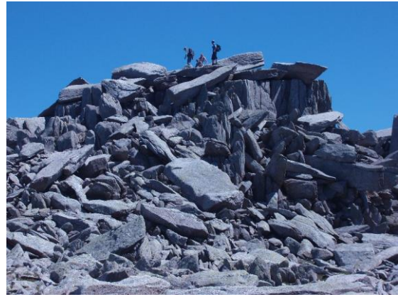
Scramble over the 'Castle of the Winds', Glyder Fach