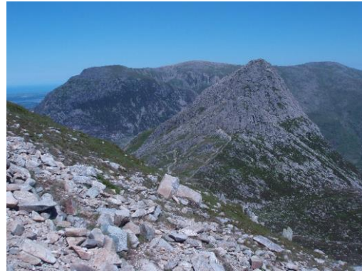
Looking north to Tryfan, Carneddau beyond