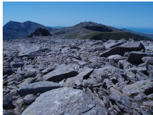
Glyder plateaux – looking west towards Glyder Fawr

After leisurely refreshments we were on our way again, ascending steeply the slopes of Y Garn in fierce sun. We soon topped out and were enjoying the extensive panorama down into Idwal and Nant Ffrancon. Then follows a drop down to a further col and a further climb onto Foel goch, which may be avoided via a traverse path across its western slopes. Dropping steeply to the next col, alternative routes forward are presented; you could continue north-west over Mynydd Perfedd and Carnedd y Filiast, then descend to the upper power station lake of Marchlyn Mawr. We chose the more sporting line, swinging west to ascend Elidir Fawr (the closest high mountain to the Hut). From its rough rocky summit ridge we picked out the small path that descends to the much lower Elidir Fach where we encountered a goat herd and atmospheric sunset views across the Menai Strait to the Isle of Anglesey.